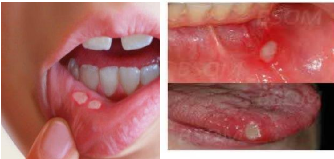
Figure 1. Recurrent Aphthous Ulcer in the labial oral mucosa and lateral of the tongue.