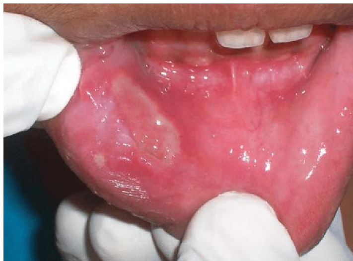
Figure 5: herpetiform aphthous ulcer (46)

This is the type of RAS that are rarest and least common one, it occurs and affecting nearly 1-10% of patients with RAS, older age female individuals are more commonly affected with Herpetiform Aphthous Ulcer, name of this type derived from its similarity to primary herpetic stomatitis but there's no association with herpes viruses, any sites of the oral cavity may be affected with keratinized mucous, the ulcer are more painful and Nemours they may be 10 to 100 in number, Small in size about 2 to 3 mm in diameter and they are very painful, these small ulcer coalescence and form larger irregular ulcer that makes a scar after healing process [28], [31].