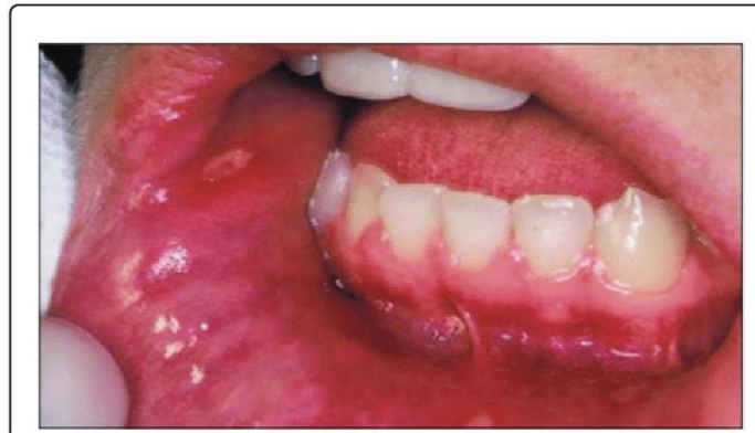
Figure 3: minor aphthous ulceration (44)

mouth, labial and buccal mucosa, typical healing of minor ulcer occur within two week without a scar on the surface, but some discomfort may be remainon the area after disappearing of the lesion [28], [31]