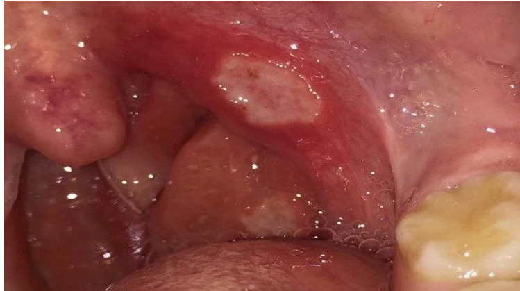
Figure (4) Major aphthous ulcer (45)