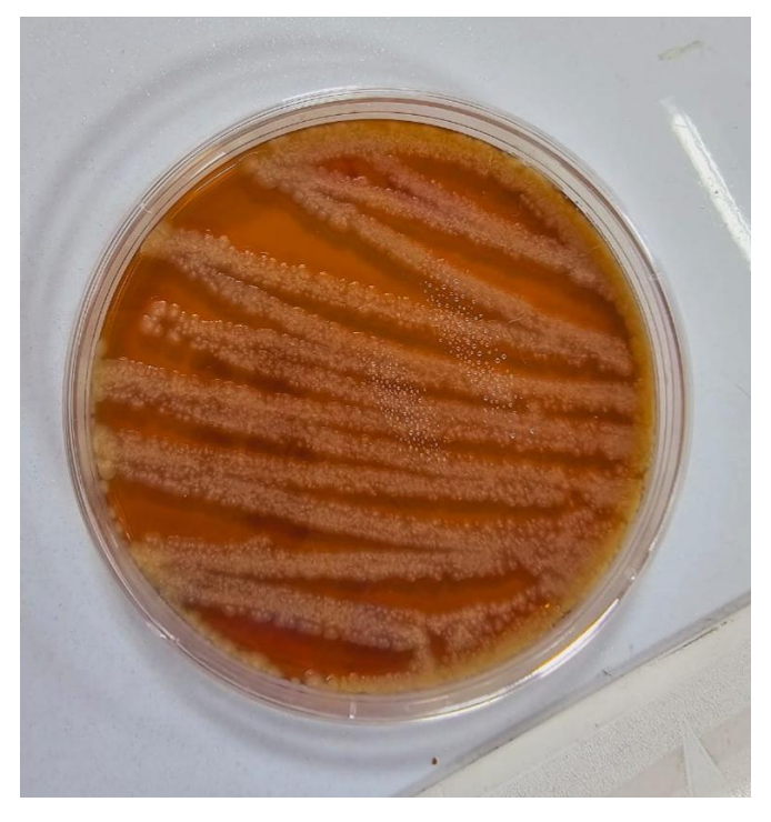
Figure 1: L. mesenteroides probiotic bacteria on MRS agar enrichment for 48hrs

ISSN 3063-8186. Published by Universitas Muhamamdiyah Sidoarjo Copyright © Author(s). This is an open-access article distributed under the terms of the Creative Commons Attribution License (CC-BY). https://doi.org/10.21070/ijhsm.v2i1.53