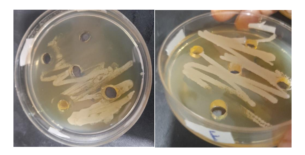
Fig. 3: The inhibition zone of Candida spp by aqueous extract of garlic

ISSN 3063-8186. Published by Universitas Muhamamdiyah Sidoarjo Copyright © Author(s). This is an open-access article distributed under the terms of the Creative Commons Attribution License (CC-BY). <a href="https://doi.org/10.21070/ijhsm.v2i2.80">https://doi.org/10.21070/ijhsm.v2i2.80</a>