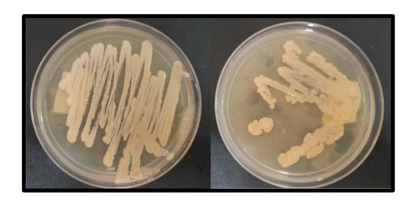
Fig 1: Candida spp on potato dextrose agar

ISSN 3063-8186. Published by Universitas Muhamamdiyah Sidoarjo Copyright © Author(s). This is an open-access article distributed under the terms of the Creative Commons Attribution License (CC-BY). https://doi.org/10.21070/ijhsm.v2i2.80