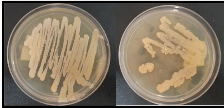
Fig 1: Candida spp on potato dextrose agar